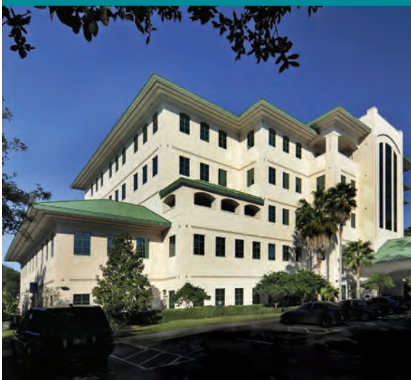
We are located in Suite 550