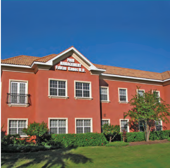
We are located in Building 100, Suite 110